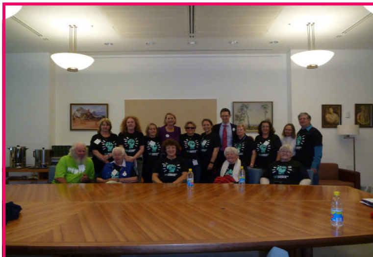
Dementia March group with local MPs Sharon Bird & Stephen Jones