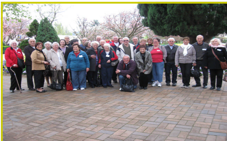
Carers at Peppers Craigieburn Bowral Retreat